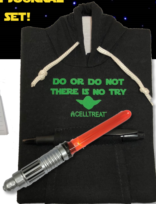
Notebook size is 7.5" X 5.25"