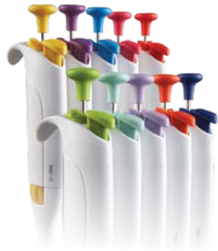
Each unit is brightly color coded and labeled with volume range (both top and side for quick visual confirmation)

Finally, responsiveness and accuracy are the most important functions during operation. The plunger assembly was designed from the ground up to reduce user hand strain. Each Pearl™ pipette requires just 2/3rds the pressure of a standard pipette, reducing hand fatigue and the potential for repetitive strain injuries (RSI).