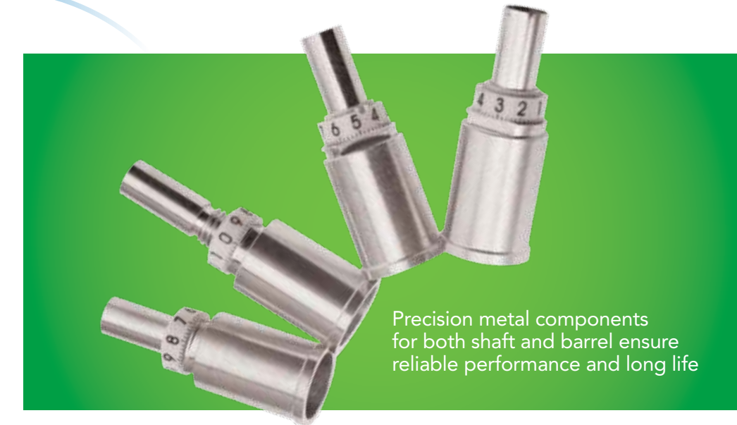
Precision metal components for both shaft and barrel ensure reliable performance and long life

Each Pearl™ pipette is built around a precision-engineered internal shaft and tip barrel. The result is increased accuracy and calibration stability, as well as enhanced chemical resistance. The outer shell is constructed from easy-to-clean polypropylene. The entire unit can be autoclaved.