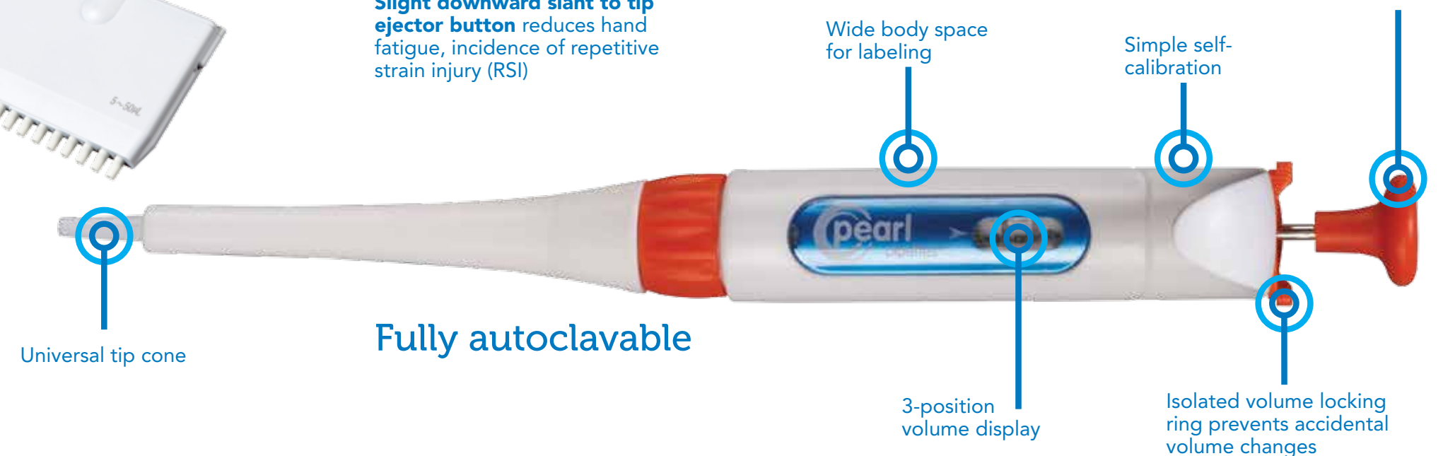
Universal tip cone